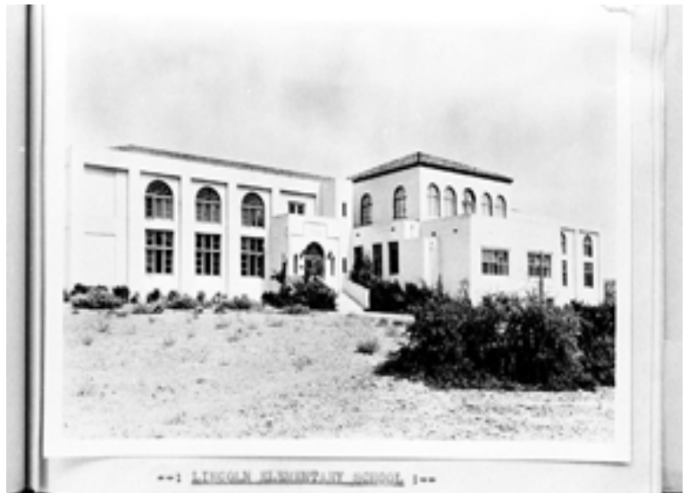
Lincoln Elementary School sometime in the early 1930’s